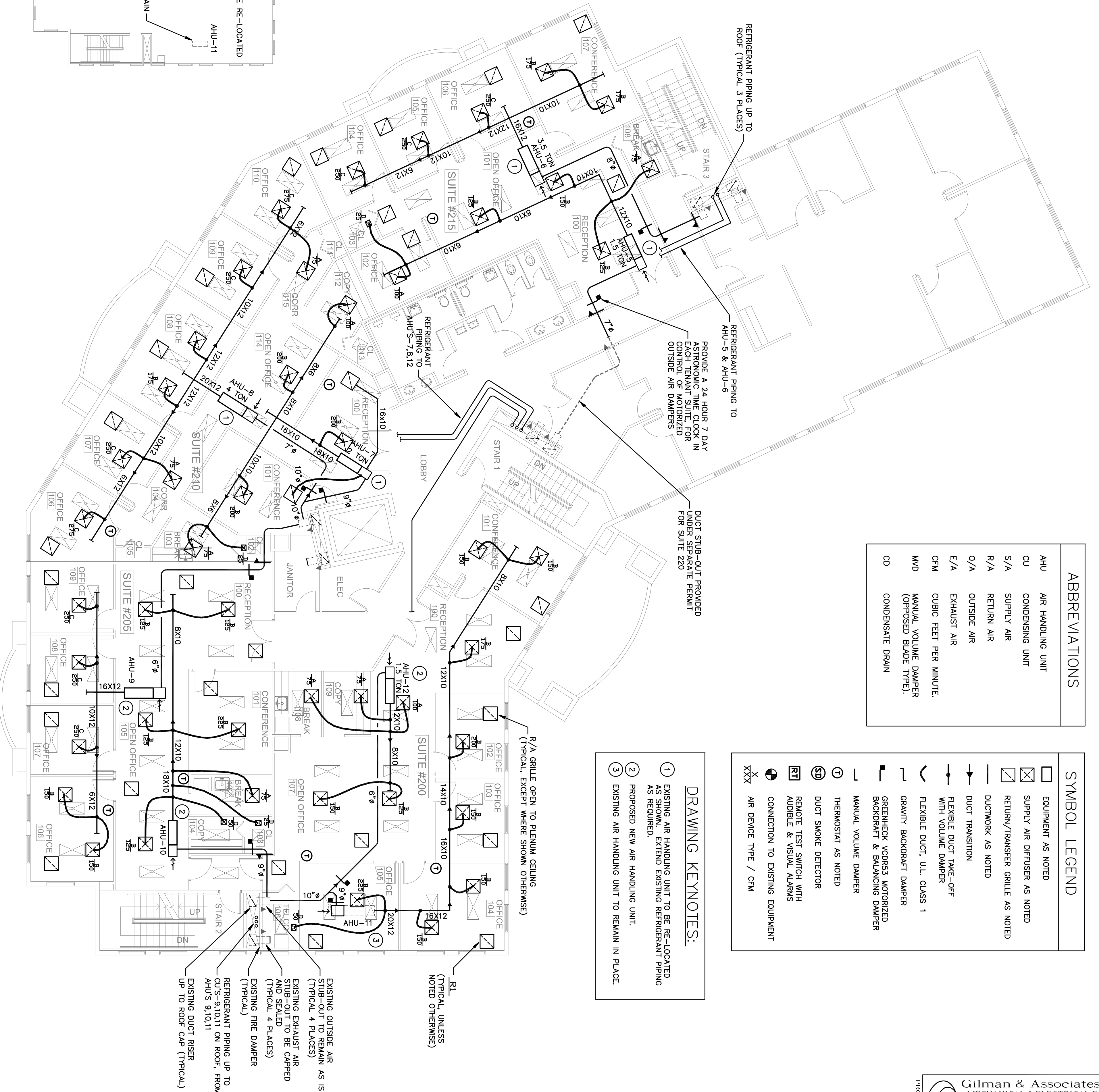
PROPOSED HVAC FLOOR PLAN